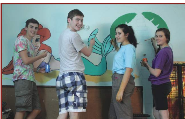
Students from Rainey Endowed School painting the Asha centre at Kusumpur Pahadi

The Rainey Endowed School team of 12 students and three teachers from Magherafelt, Northern Ireland volunteered in Kusumpur Pahadi slum colony for over a week. During this time, the team painted the Asha centre in the slum with vibrant murals and also engaged in English conversation classes with the college and high school students from the community.